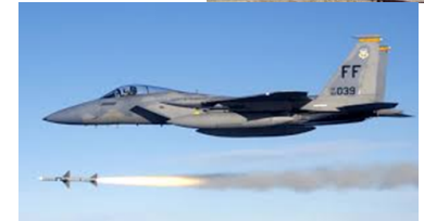
Weapon Systems Engineering